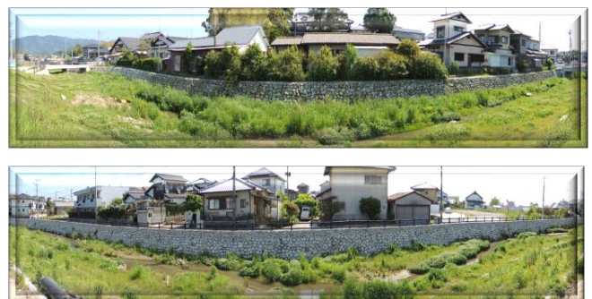
Figure 3. The first and the second phase of the Kamisaigo River Restoration Project.

The Kamisaigo River recently completed a third major river restoration project. One of the primary goals of this most recent project was the variety of the natural habitat river scenery. The restoration specifically involved placing logs and/or a series of boulders into the river. The restoration work has been started since November 2009. The first phase of the Kamisaigo River Restoration Project began at the Station 3 and ended about 70 m upstream in the winter of 2009. The second phase of the project began in the summer of 2010 and was completed during the winter of 2011. The third phase of the project began in the summer of 2011 and was completed during the winter of 2012. This second phase covered about 500 m of river from station 2 to 5, and was the primary focus of this research, Figure 3.