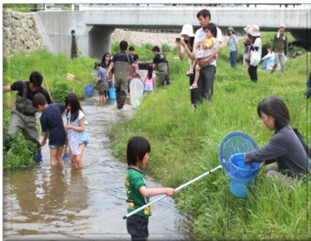
Figure 6. Education on river environment