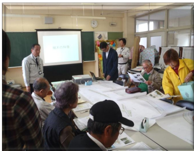
Figure 5. The stakeholder and the restoration community conduct comprehension workshop every season

Ministry of Land, infrastructure, Transportation and Tourism of Fukutsu Bureau, academia (university researchers and other experts) and citizens active in this effort and joined to create a network. Every season the stakeholders who initiate river restoration projects include private individuals, non-governmental organizations (NGOs), governmental organizations and various collaborative combinations of the above and the restoration community (practitioners, decision makers and scientists) conduct comprehension workshop for this river, which administrative organizations perform discussion and cooperation each other for constructing and coordinating an agreement toward success this river, Figure 5. Such activities are designed to love this river, such as education for elementary school students in which students played with aquatic life in the Kamisaigo River, clean up, cut the grass and plant the flower that a key to keeping this river beautiful, and other various events, Figure 6.