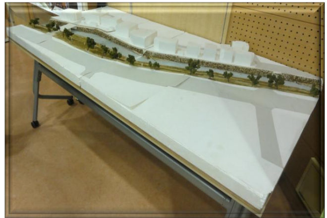
Figure 2. The landscape model of Kamisaigo River

2) March 14, 2008, retaining wall maintenance, 3) May 7, 2008, hydrophilic zone, 4) June 13, 2008, hydrophilic zone, 5) July 16, 2008, landscape zone, 6) September 1, 2008, Nature walks zone: adjacent medical facilities and adjacent to large commercial facilities, 7) October 20, 2008. Propose of Nature walks zone with point of the design: provide slope that the wheelchair can access and walking paths to enjoy the scenery, 8) November 26, 2008, Summary of the Kamisaigo River workshop: creating a multi-model study and creation of natural rivers. Construction plans cross linked change with Shiroumaru Bridge in 2008, Sakura Bridge in 2010, Kifune Bridge in 2010, and Himaki Bridge in 2012.