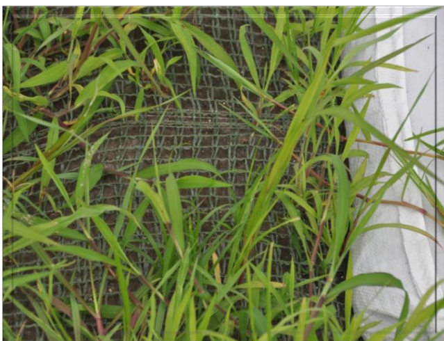
Figure 4. Erosion control mats in the Kamisaigo River.

What happened to a particular landscape in an effort to help the Kamisaigo River become stable. Rock gabions have been used to stabilize and protect steep banks. Gabions are made out of a small meshed wire grid filled with coarse gravel. Living sticks or sprouted plants are incorporated. Stabilization is enhanced through the roots of vegetation and the connection of all elements. Gabions are rectangular wire baskets made of heavy galvanized or coated wire mesh. They are filled with small to medium sized rock and soil. Gabions are laced together to form terraces or a wall. Placing live branches between each layer of rock filled baskets incorporates vegetation, Figure 4. The resultant design gave the erosion protection and increased flood capacity required while also greatly enhancing the habitat over the 300m.